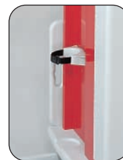
O-2 Oxygen Tank Brackets