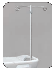
IV-3 IV Pole and Mounting