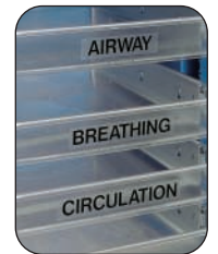
ER-LBL Airway, Breathing, Circulation Labels