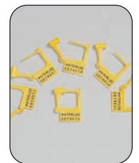
PS-100 Plastic Breakaway Seals