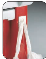
ABH-1 Ambu Bag Hooks (2)

(4 each).....7.5"W x 2.9"D x 2.8"H (2 each).....7.2"W x 5.6"D x 2.6"H