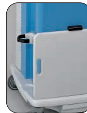
CBB-ER Cardiac Board and Bracket