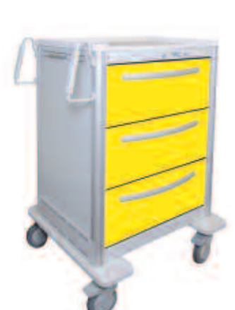
UTGKA-999-YEL 3-drawer Elite Aluminum isolation cart Drawers: (3) 9"H Available in five different locking options. See page 6.

For Elite cart features and dimensions see page 6 and 7.